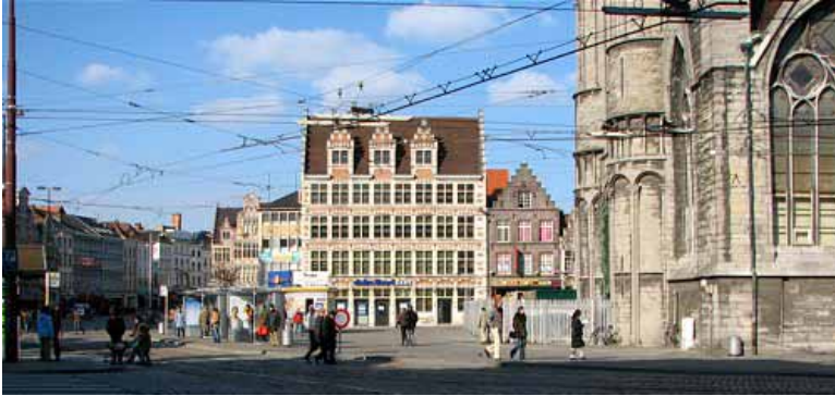
First views of Ghent