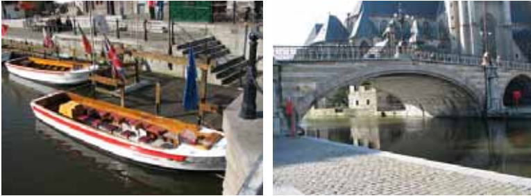
Canal Boat and bridge across the canal

surprised and pleased with the restaurant and the hot chocolate. We spent the afternoon on an open canal boat viewing the historic old buildings and listening to the many stories of the guilds and history presented by the canal boat guide.