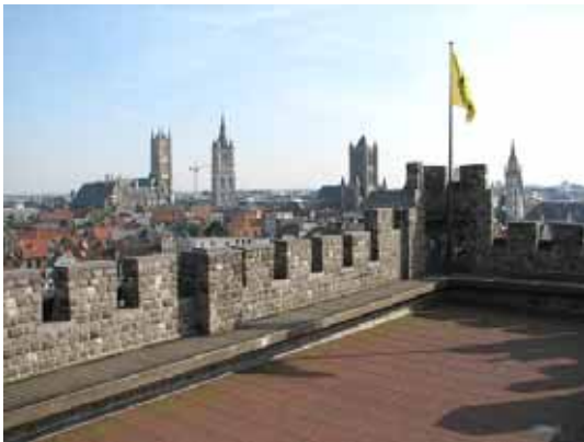
View of Ghent from the Castle