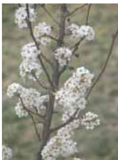
Cherry Blossoms from our motel window

The Cherry Blossoms were out all over DC and were beautiful. I had never seen them before and felt it was a gift to view them.