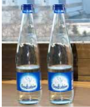
Belgium water in glass bottles

Every time I woke up, I would pour a glass of water and drink to quench my terrible thirst. I don't think a person stuck in the middle of a desert could have been thirstier than I was.