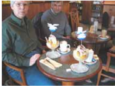
The Castle and Peach Melba at the Café Lefte