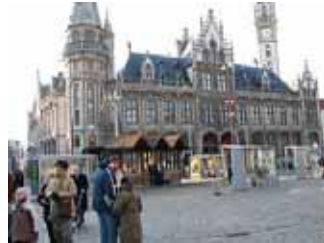
The old buildings