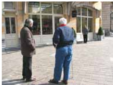
My favorite gift store and crutching around Ghent

Of course we had to take chocolate home too. We filled up a suitcase with quite a bit of Belgium Chocolate. We had a great little lunch and headed back to the Holiday Inn. I was sad to have to say goodbye to Ghent.