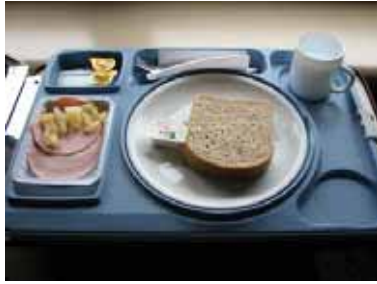
Dinner at the hospital.