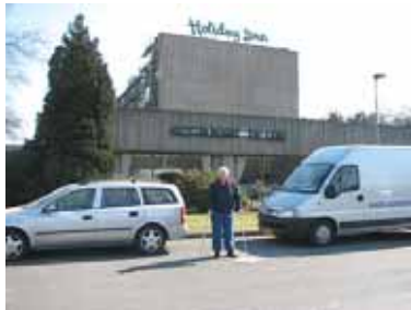
The Holiday Inn Ghent