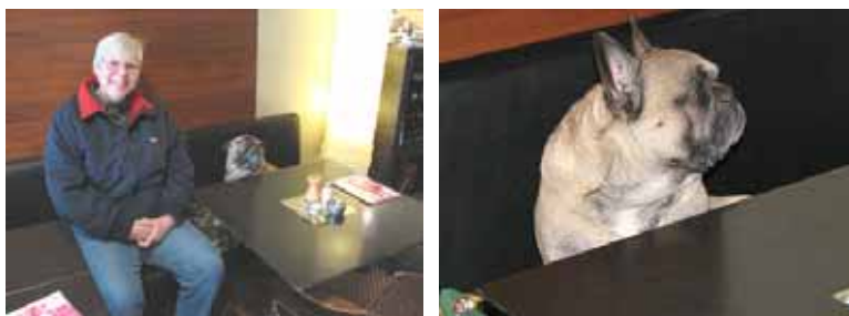
Pat and Victor the French Bulldog

was astoundingly beautiful. The fountains were stunning even on a very cold, windy day. The cathedrals were breathtaking. I took more than six hundred photos while I was in Belgium. I had purchased a new digital camera just for the trip and was very happy that I had it with me.