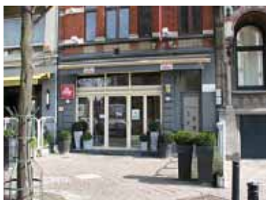
Het Lamb Gods Restaurant

We had a wonderful afternoon in the very cold, windy, chilly weather. My first memory of Belgium will always be going into the restaurant called Het Lamb Gods. This was the home of Victor, the French Bulldog. He was the restaurant owner's dog and sat at the rear table on his own little cushion and greeted customers. I love dogs, so I knew this was going to be a great place to eat. What a place Ghent was turning out to be - dogs allowed to accompany