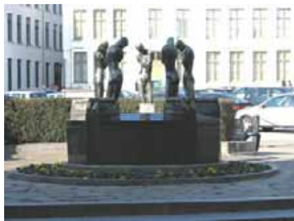
The wonderful fountains

Ghent was an absolutely beautiful town. I had never seen buildings that were hundreds of years old. The architecture