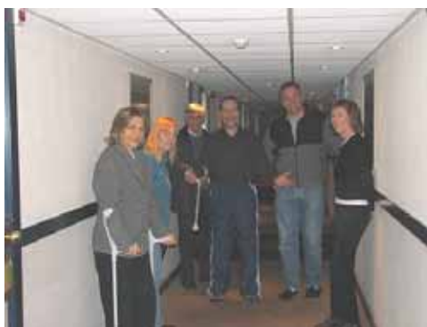
Hippy hall gathering