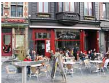
Du Progress Restaurant