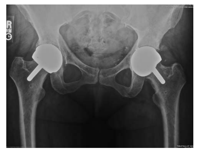
FIGURE 3. Anteroposterior radiograph of a 46-year-old woman who has undergone bilateral hip resurfacing surgery using Birmingham prostheses. On the right the outcome is successful but on the left, the hip is painful from failure of osseointegration, and there is a lucent line around the acetabular prosthesis.

Acetabular components that have not osseointegrated can be a source of pain; however, this often is difficult to detect radiographically, at least initially, before radiolucent areas appear. The initial press fit limits the amount of initial pain. Within a few months, pain from poor osseointegration may occur. The onset of this pain generally is earlier than the onset of pain from metallosis. A loose acetabular