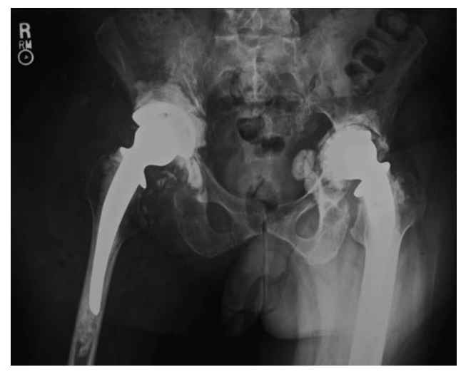
FIGURE 1. Anteroposterior radiograph of the pelvis in a 58-year-old woman 40 years after receiving bilateral McKee-Farrar total hip replacements. On the left, the original metal-on-metal prosthesis demonstrates acetabular loosening. On the right, a revision using a custom-made, two-piece titanium and polyethylene acetabular prosthesis has been performed.

hair, blood, urine, vital organs and, if present, placenta.<sup>21</sup> Thus, the cobalt level should be measured several months or a year after surgery to avoid a misleading result caused by the wearing-in process of the prosthesis.<sup>22,23</sup> For unilateral metal-on-metal joint resurfacing, a cobalt level \leq 4 \,\mu g/L can be expected and for bilateral resurfacing the cobalt level is generally <9 \,\mu g/L . Cobalt levels > 100 \,\mu g/L can be found occasionally. Patients with equivocal levels should be followed over time with repeated testing. If the cobalt level is increasing, metallosis should be suspected. In some laboratories, testing of the joint fluid is possible but usually the appearance of the aspirated fluid alone is diagnostic of metallosis (Figure 2).