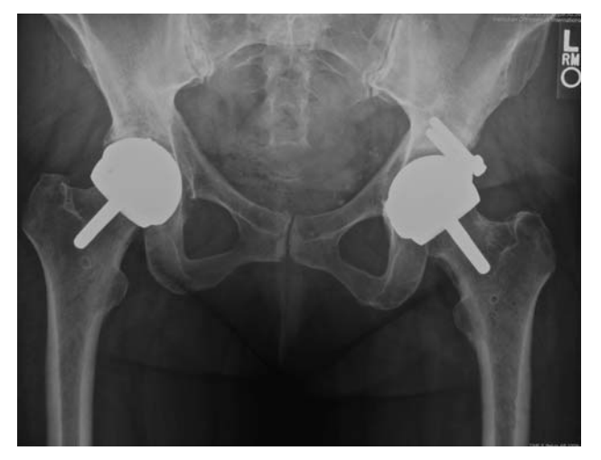
FIGURE 4. A revision of the left acetabular component has been performed using a dysplasia component with supplemental screw fixation.

component will elevate cobalt levels modestly. During joint aspiration, local anesthetic that is instilled into the joint can be helpful in establishing the diagnosis. Revision surgery is very successful for patients with failure of osseointegration.