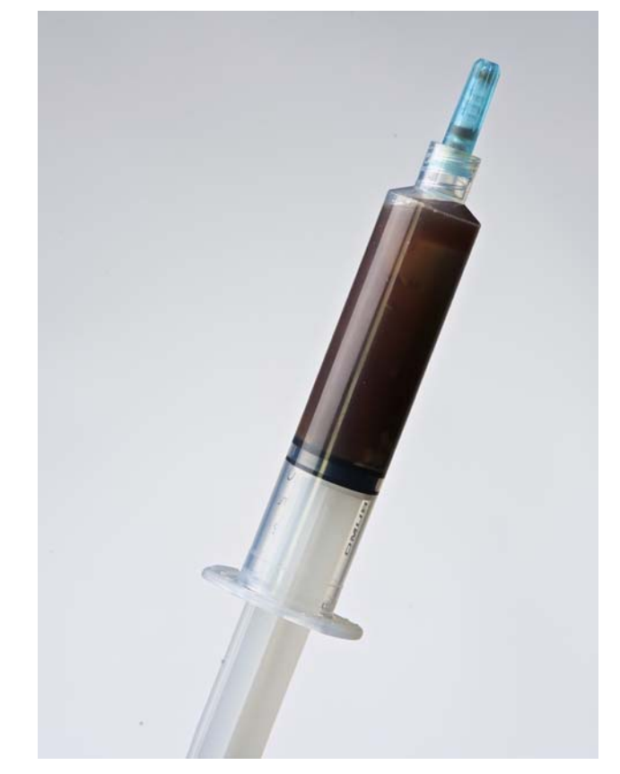
FIGURE 2. Syringe shows joint fluid that has been aspirated from a patient with metallosis 2 years after hip resurfacing surgery.

Nearly 40 years ago, laboratory wear studies showed that cobalt-chrome alloy articulating components released cobalt and chromium into solution and that patients implanted with these prostheses had elevated levels of cobalt and chromium in their blood and urine.<sup>26</sup> Evans et al. ,<sup>27</sup> in