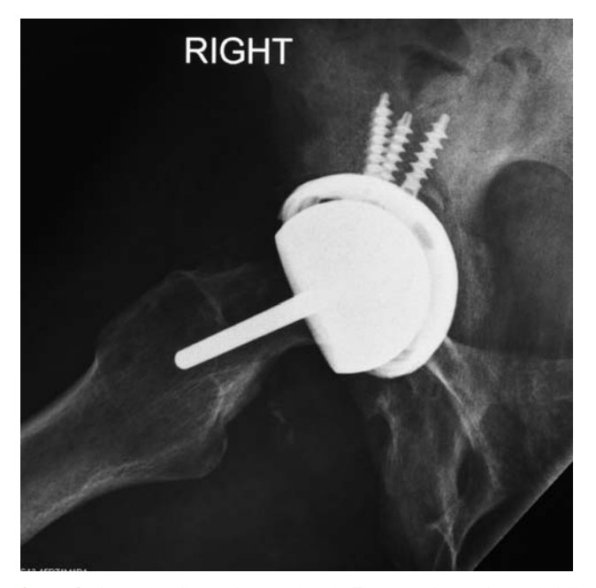
FIGURE 9. Lateral radiograph of patient in Figure 8 shows the availability of dome screw adjunctive fixation in the compromised acetabular bone.

When presented the option of polyethylene resurfacing, patients often question the durability of this material. The wear simulator data available at this time suggest that even with the larger diameter femoral components, 10 or more years of useful implant life are possible. Most patients requiring resurfacing are young and will need more than 10 years of use from their prosthesis. If wear-through occurs, a straightforward revision to another polyethylene liner