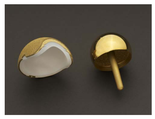
FIGURE 10. Photograph shows a currently available resurfacing prosthesis with a titanium-backed polyethylene acetabular-bearing surface as an alternative to metal-on-metal.

compared with the initial resurfacing procedure and revision to total hip replacement. Concerns remain about the long-term durability of polyethylene, particularly in the larger and thinner sizes.<sup>35,36,50,51</sup> Cemented acetabular components may loosen over time, but the longevity with this solution is often many years.<sup>35,36,50</sup>