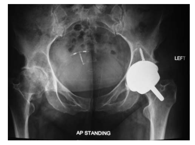
FIGURE 7. The R3 two-piece titanium-backed cobalt bearing prosthesis has been used to provide a successful revision of the hip resurfacing.

acetabulum is more difficult because of the retained femoral head and neck. Most patients presenting for resurfacing have an abnormally shaped, dysplastic native acetabulum. The presenting acetabulum is oriented vertically, and attempts to preserve the bone during preparation tend to lead to increased anteversion and vertical orientation. It is very unusual to see an acetabular component positioned more vertical than the native acetabulum. Also, the acetabular bone is hard and sclerotic in the areas where there has been uneven weight bearing. Resurfacing acetabular components are driven into the acetabular bone; the harder bone in some areas and softer bone in others tend to tilt the acetabular component at the time of impaction or with later load bearing. The rigid monobloc resurfacing acetabular components are difficult to position.<sup>32</sup> The radiographic appearance of an acetabular component is a combination of version and abduction. In rough terms, each degree of increased anteversion becomes a degree of increased vertical acetabular orientation. In recent reports, only 40% of resurfacing acetabular prostheses are positioned ideally even in the hands of experienced hip surgeons.<sup>49</sup>